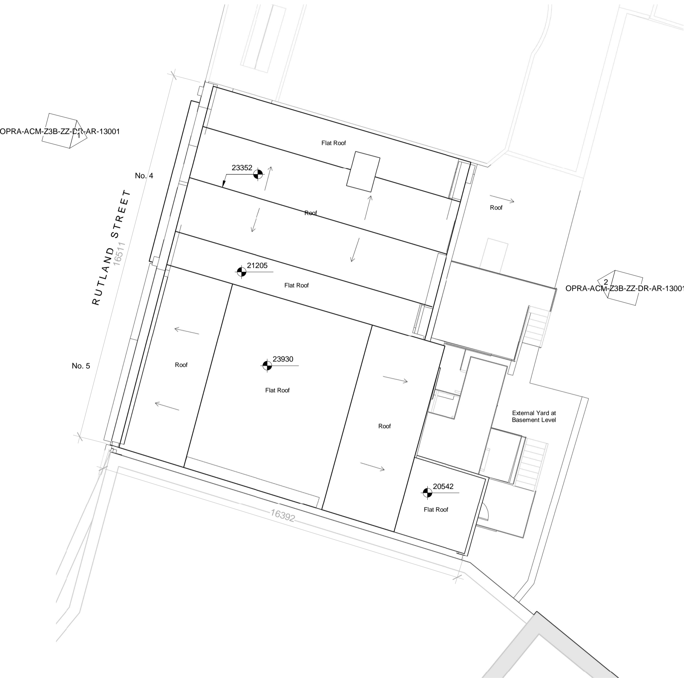
2 Proposed Roof Plan SCALE: 1 : 100