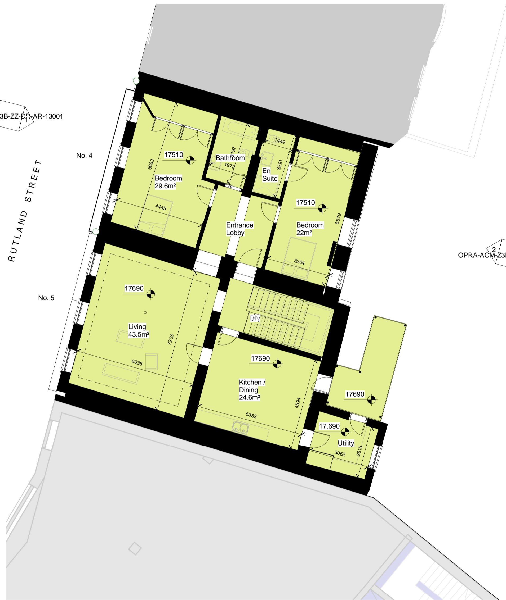
1 Proposed Third Floor Plan SCALE: 1 : 100

This drawing has been prepared for the use of AECOM's client. It may not be used, modified, reproduced or relied upon by third parties, except as agreed by AECOM or as required by law. AECOM accepts no responsibility, and denies any liability, whatsoever, to any party that uses or relies on this drawing without AECOM's express written consent. Do not scale this document. All measurements must be obtained from the stated dimensions.